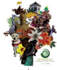
The 2007 annual report