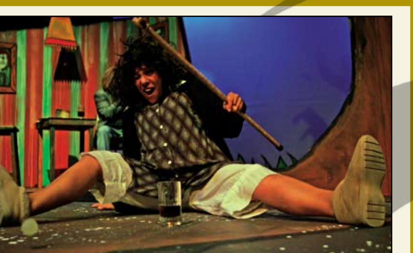
A BLAST OF CREATIVITY