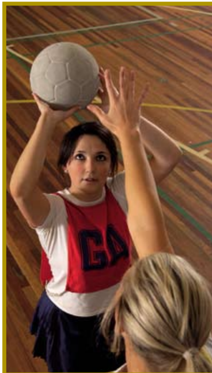
Our goal is increased participation.

You can find out more about these funding areas on our website.