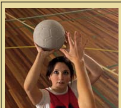
■ Sport funding reviewed.....pg7