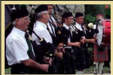
■ Waipu Museum celebrates.....pg5