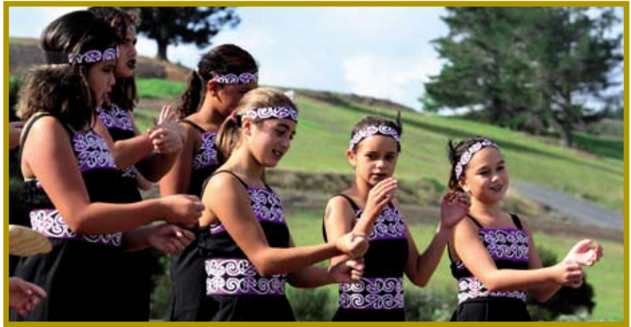
Children from Russell celebrate the opening with a kapa haka performance.