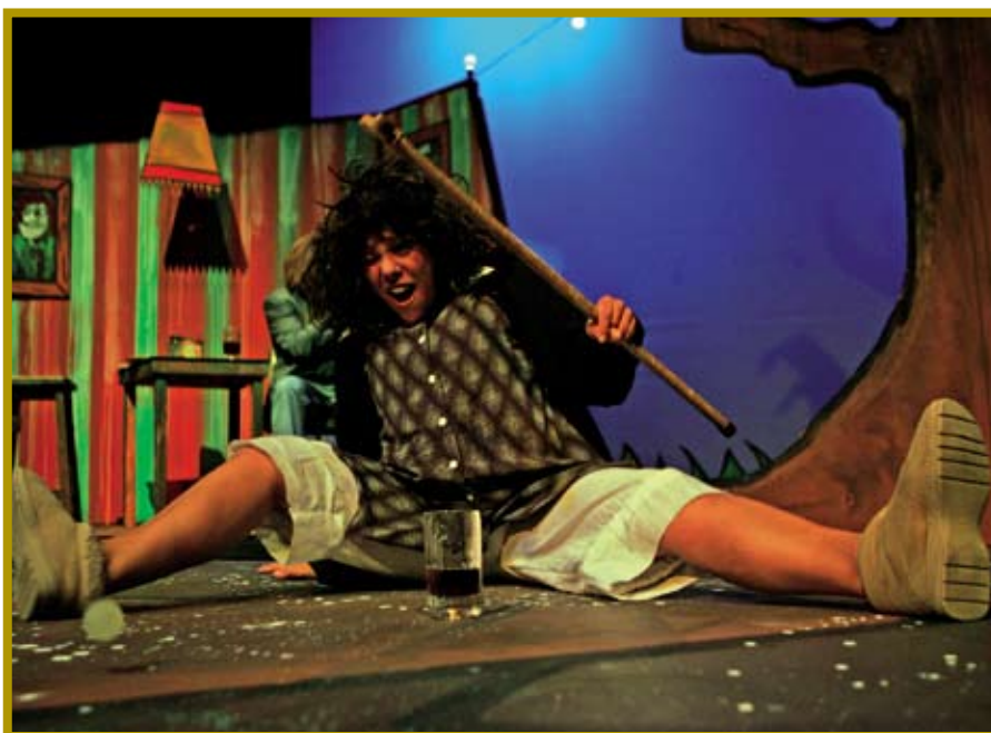
The Twits drew full houses to every session.

This year the 'Full House' sign went up at