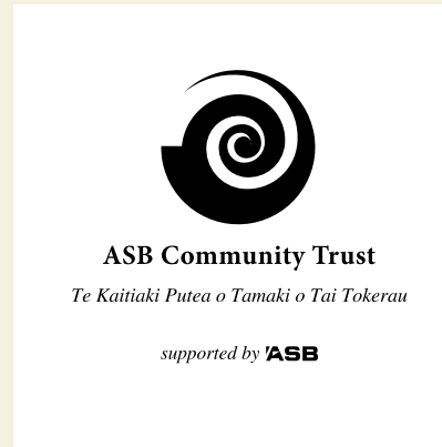
usage black on white background