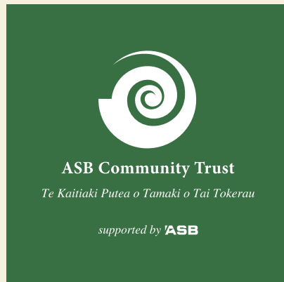
Usage logo at colour background