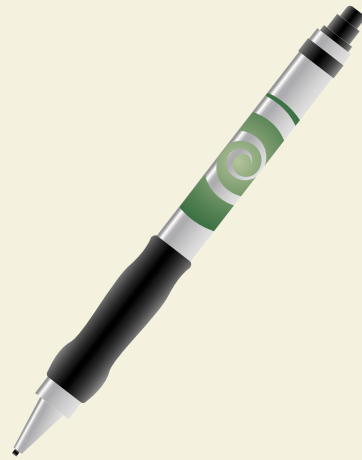
logo usage on pen