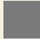
Cool Grey, Pantone 10 Process Equivalent C=0% M=2% Y= 0% K=60%