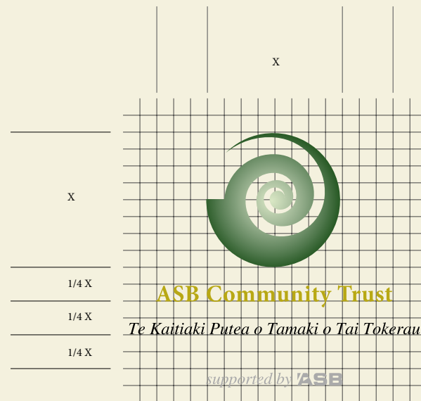
Dimension and spaces at Logo type