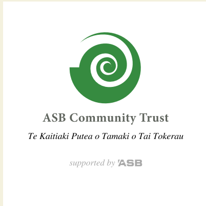
usage full colour on white background