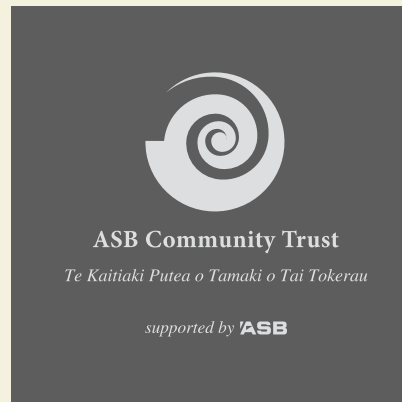
usage light grey on dark grey background