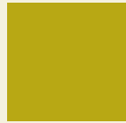
Yellow, Pantone 457 Process Equivalent C=0% M=15% Y= 100% K=28%