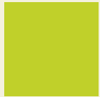
Pantone 390 Process Equivalent C=22% M=0% Y= 100% K=8%