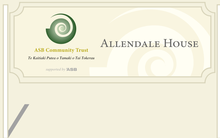
Signage Allendale House