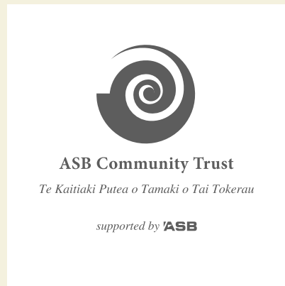
usage greyscale on white background