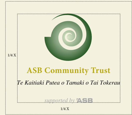
Minimum distance around logo