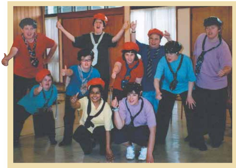
/ Dance and drama is all part of the mix at Eastgate.

The trust puts a strong emphasis on community involvement, so clients spend part of their day in activities such as work placements, art