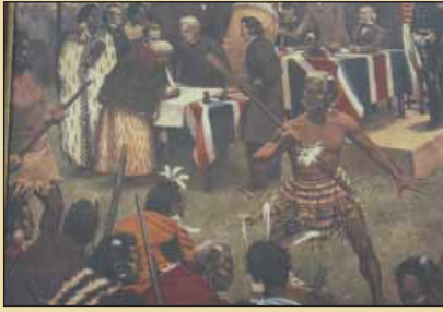
/ Waitangi: new plans for historic icon Page 4