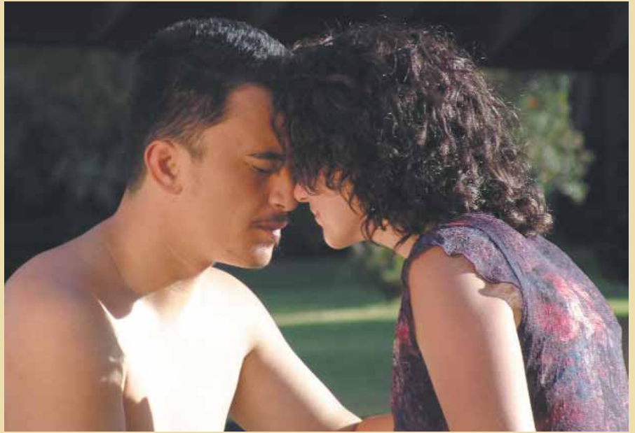
/ Visitors join in a traditional hongi at the Treaty Grounds, where new facilities will enhance the historic experience.

"The site opens up the opportunity to draw in the maritime aspects of the bay, which are cur-