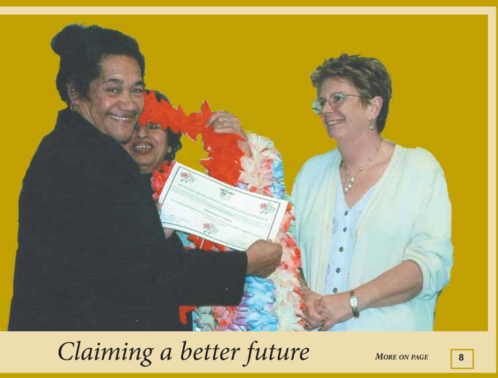
Claiming a better future