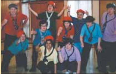
/ Eastgate: creating a better future Page 6